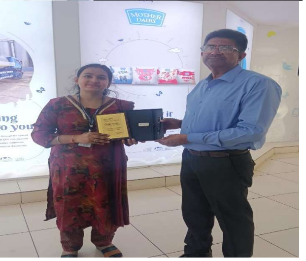
A woman in a red sari is presenting a certificate to a man in a blue shirt. They are standing in front of a Mother Dairy display board.