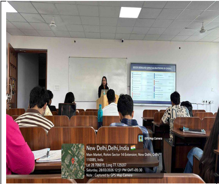
New Delhi, Delhi, India Main Market, Rohini Sector 14 Extension, New Delhi, Delhi, 110085, India Lat: 28.706619, Long 77.129207 Saturday, 28/03/2026 12:51 PM GMT+05:30