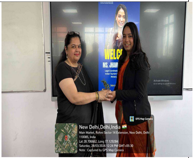
New Delhi, Delhi, India Main Market, Rohini Sector 14 Extension, New Delhi, Delhi, 110085, India Lat: 28.706652, Long 77.129284 Saturday, 28/03/2026 12:24 PM GMT+05:30 Note : Captured by GPS Map Camera