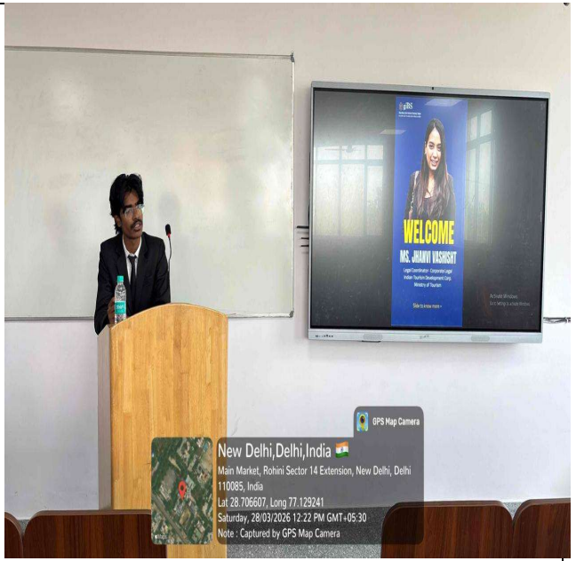
New Delhi, Delhi, India Main Market, Rohini Sector 14 Extension, New Delhi, Delhi, 110085, India Lat: 28.706607, Long 77.129241 Saturday, 28/03/2026 12:22 PM GMT+05:30 Note : Captured by GPS Map Camera