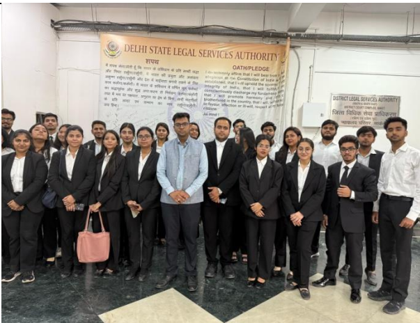
BA LLB 2A With DLSA Saket Court Ld. Secretary